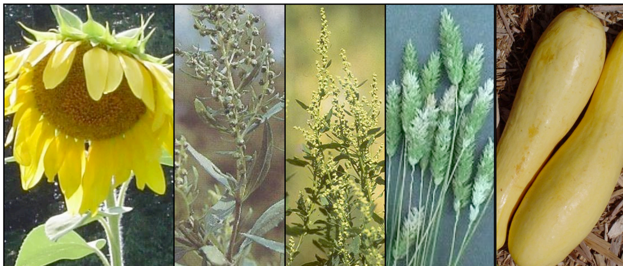
(L-R) sunflower, sumpweed ( museum.state.il.us ), goosefoot ( botany.cs.tamu.edu ), maygrass ( cas.sc.edu ), squashes.

The plants domesticated there belong in the same category as corn, potatoes, and rice. They include eight seed-producing plants that archaeologists call the “Eastern Agricultural Complex.” The seeds from sunflower and sumpweed were sources of oils, fats, and other nutrients. Goosefoot, maygrass, erect knotweed, giant ragweed, amaranth, and little barley seeds provided starchy carbohydrates. “Fleshy” squash, with soft tissue and thin skin, is another plant they domesticated.